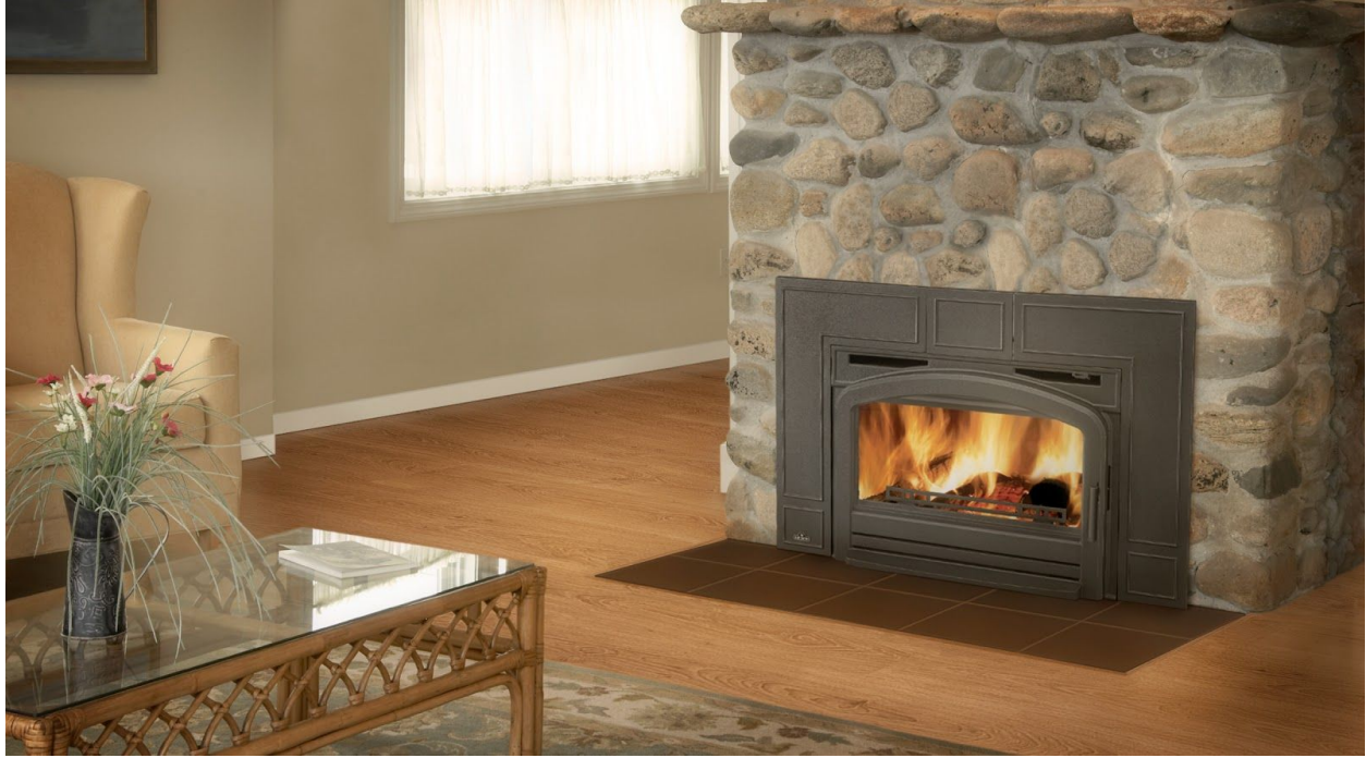
EPI3T Napoleon Wood-burning insert